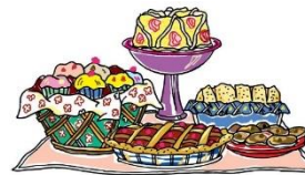
BAKE SALE AUCTION

We have just one more week for collecting the items and/or money for the Emergency Cleanup Buckets for Church World Service. We will be having a bucket assembling party after our worship service on Sunday, April 14 th . Please consider purchasing items or making a monetary donation so that we can support this vital global mission.